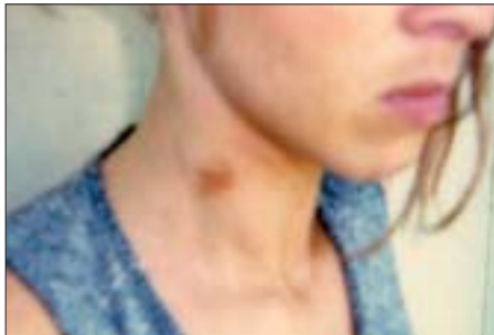
Figure 4. Often, when a single bruise is the sole finding on a victim's neck, it may be caused by the assailant's thumb as this opposing digit has the greatest vector force in a human grip. It may or may not manifest up to 24 hours after the assault took place.