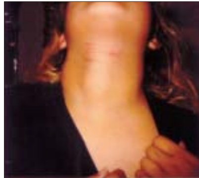
Figure 2. These markings may have been caused by the victim's fingernails in an attempt to remove a chokehold. They also may be caused by the assailant adjusting their hands and applying force during a vigorous struggle. The webbing between the thumb and index finger can produce the linear lesions shown.