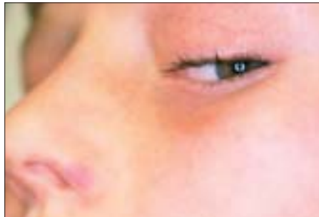
Figure 5. Diffuse petechiae with a confluent pattern found on upper eyelid of a young child strangled by an adult male. Due to a thin dermal layer, the eyelids are among the most susceptible tissue to manifest visible petechiae on both the external and internal surfaces.